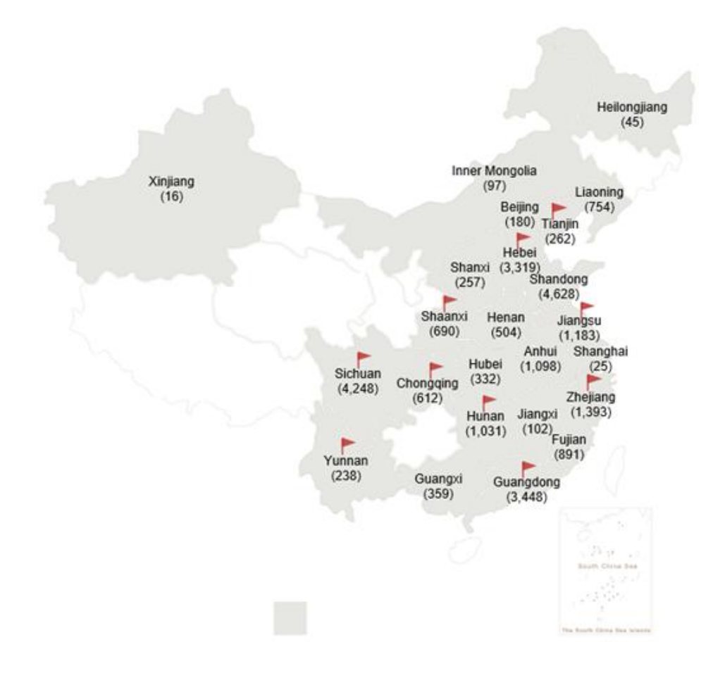
(1) The red flags represent provinces where we have established cooperation with wealth management studios.

The map below shows our coverage network by number of seed clients and wealth management studios<sup>(1)</sup> as of June 30, 2022: