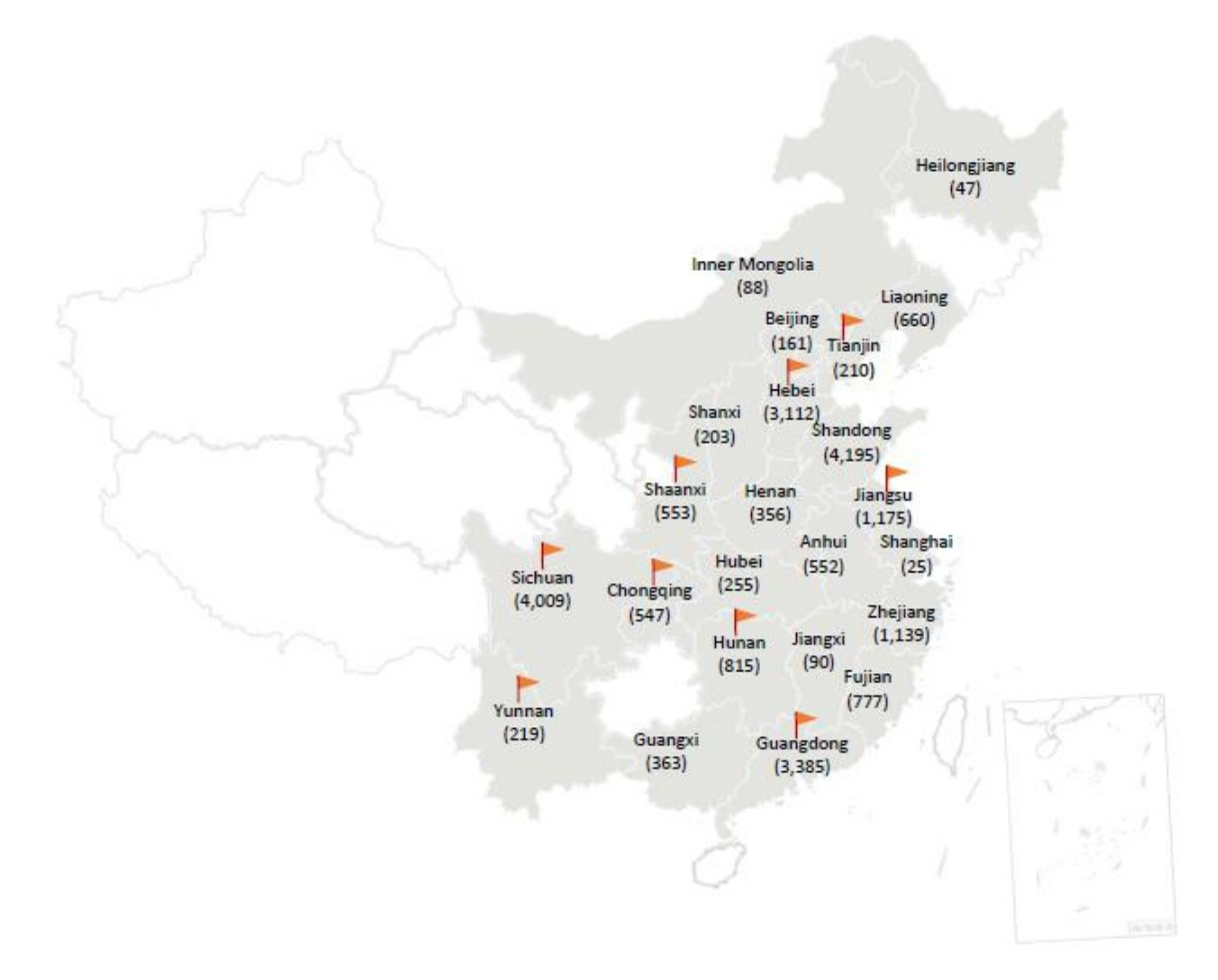
(1) The red flags represent provinces where we have established cooperation with wealth management studios.

The map below shows our coverage network by number of seed clients and wealth management studios <sup>(1)</sup> as of June 30, 2023: